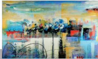
NEIL YOUNG: WINTER THAW